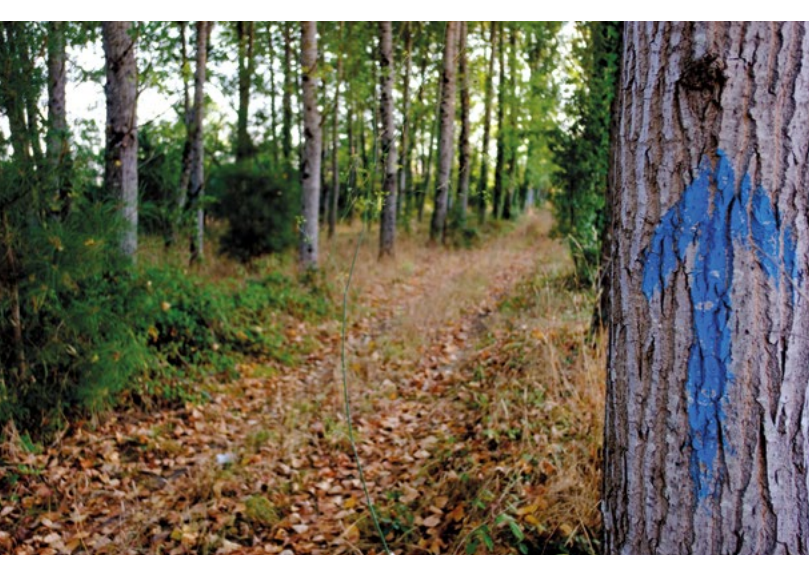
▶ 40°21'37" N 8°27'19" W

features, above all the pediment above the door, the window frames and the pinnacle of the side tower.