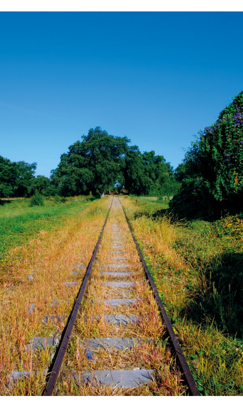
→ 40°47′2″ N 8°29′15″ W