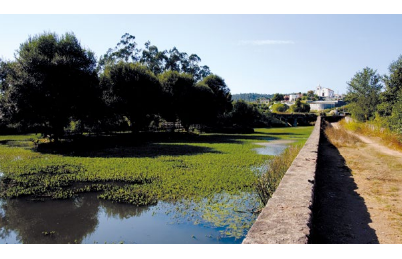
>> 40°37'58" N 8°28'9" W

way into the Municipality of Águeda. Having passed through various small village and then crossed the bridge over the River Vouga , you will reach Lamas do Vouga , a historic village on the river.